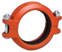
1 – 8"/DN25 – DN200